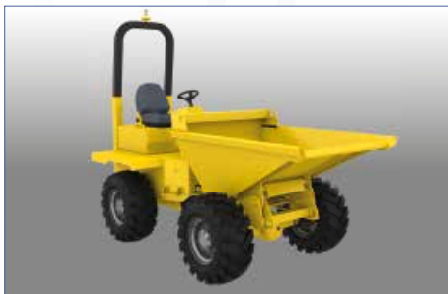
Powered wheelbarrow and mini dumper